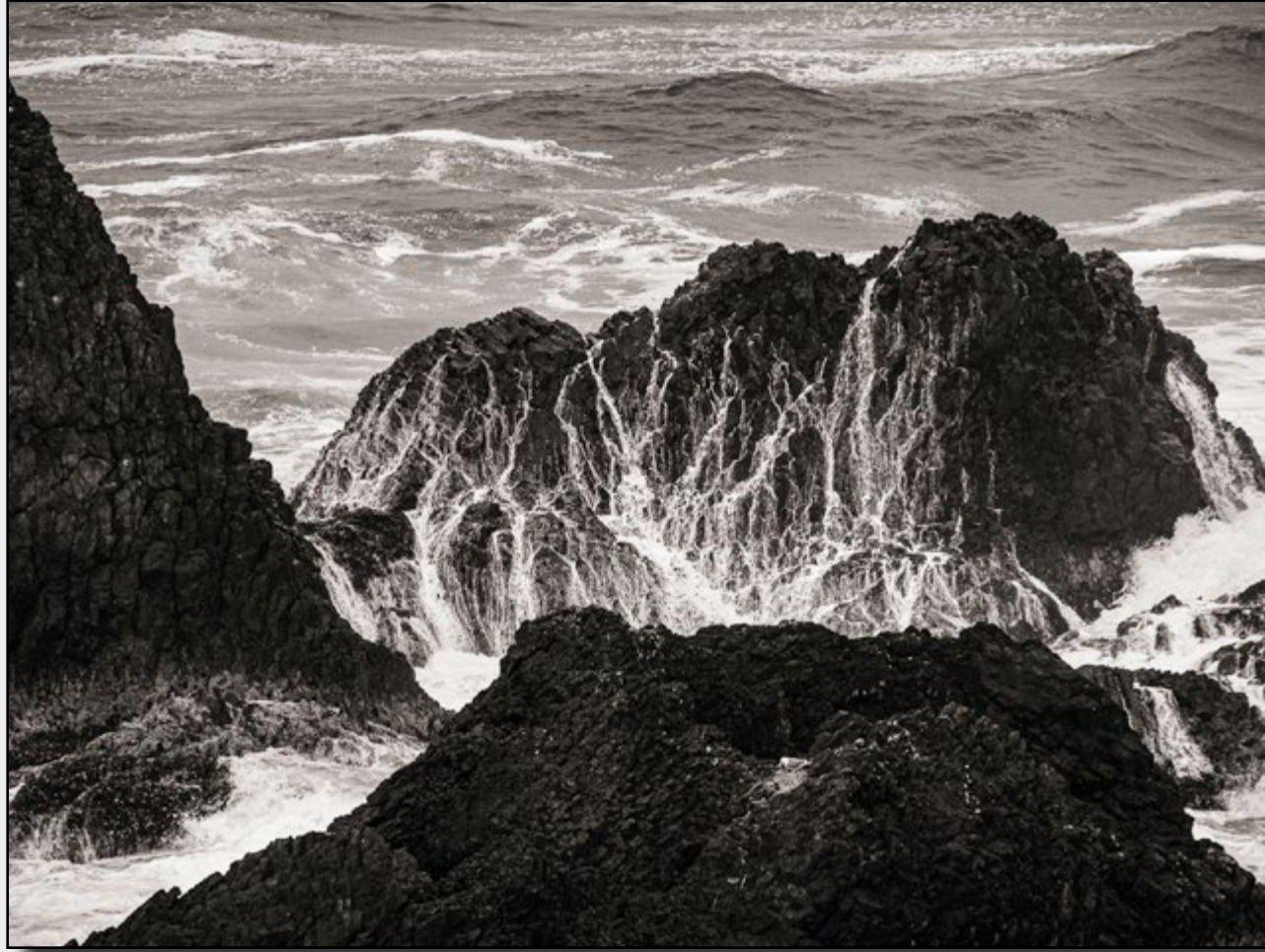
A Moment Later