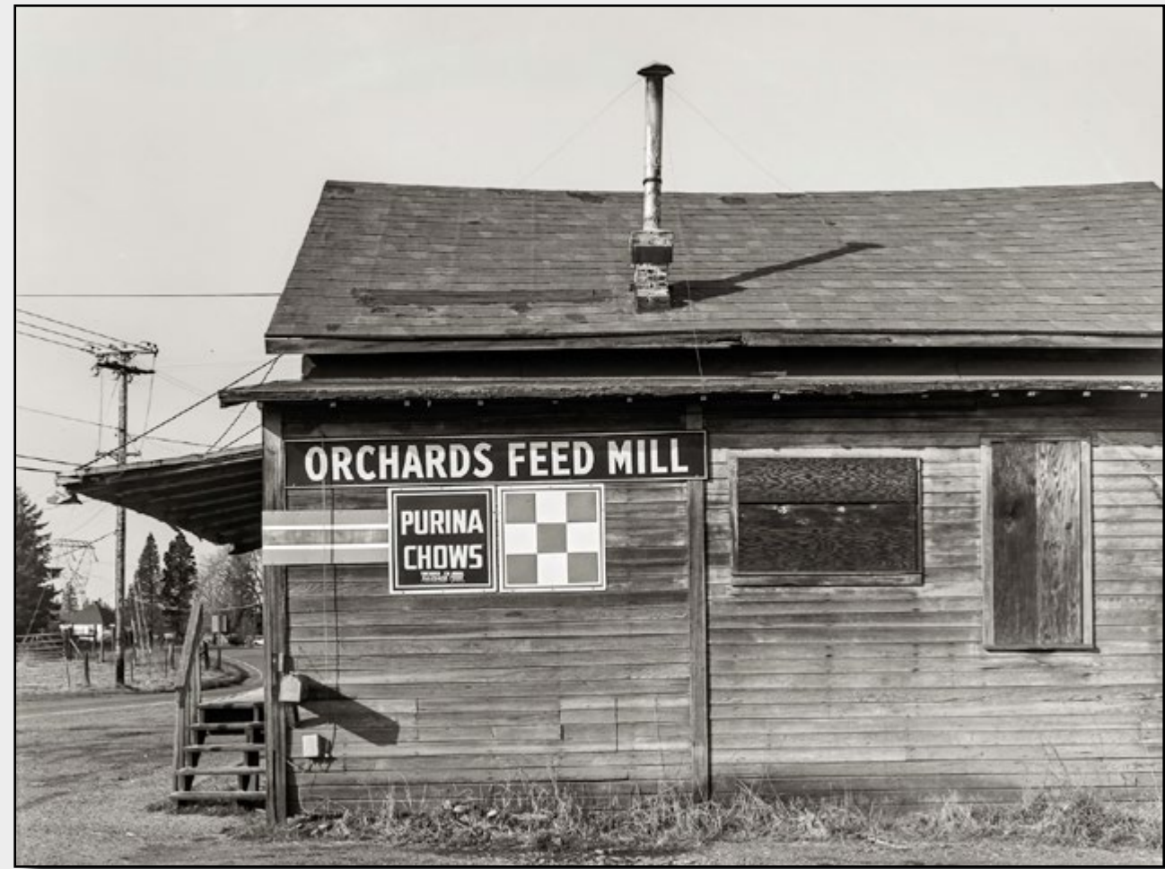
Feed and Seed

I can't remember if it was my wife that told me about The Orchards Feed Mill, but I went out one afternoon with my view camera and came home with four negatives. In those days, four negatives for an afternoon's worth of work was quite a haul. I never went back to the Orchards Feed Mill but the mental seed was planted. After we moved to North Carolina, I found the Carpenter Feed Store and I harvested that inspiration by creating the Carpenter Portfolio .