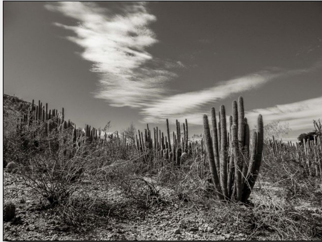
A Convenient Wilderness